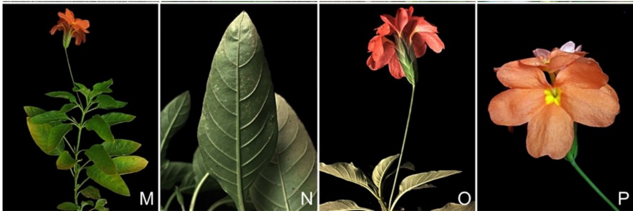
Figure 1. Four alien plants in Sumatra: A–D. Acalypha herzogiana ; E–H. Coccinia grandis ; I–L. Coleus monostachyus ; K–N. Crossandra infundibuliformis .

5. Ficus natalensis subsp. leprieurii (Miq.) C.C. Berg. (Moraceae). Fig. 2A–D.