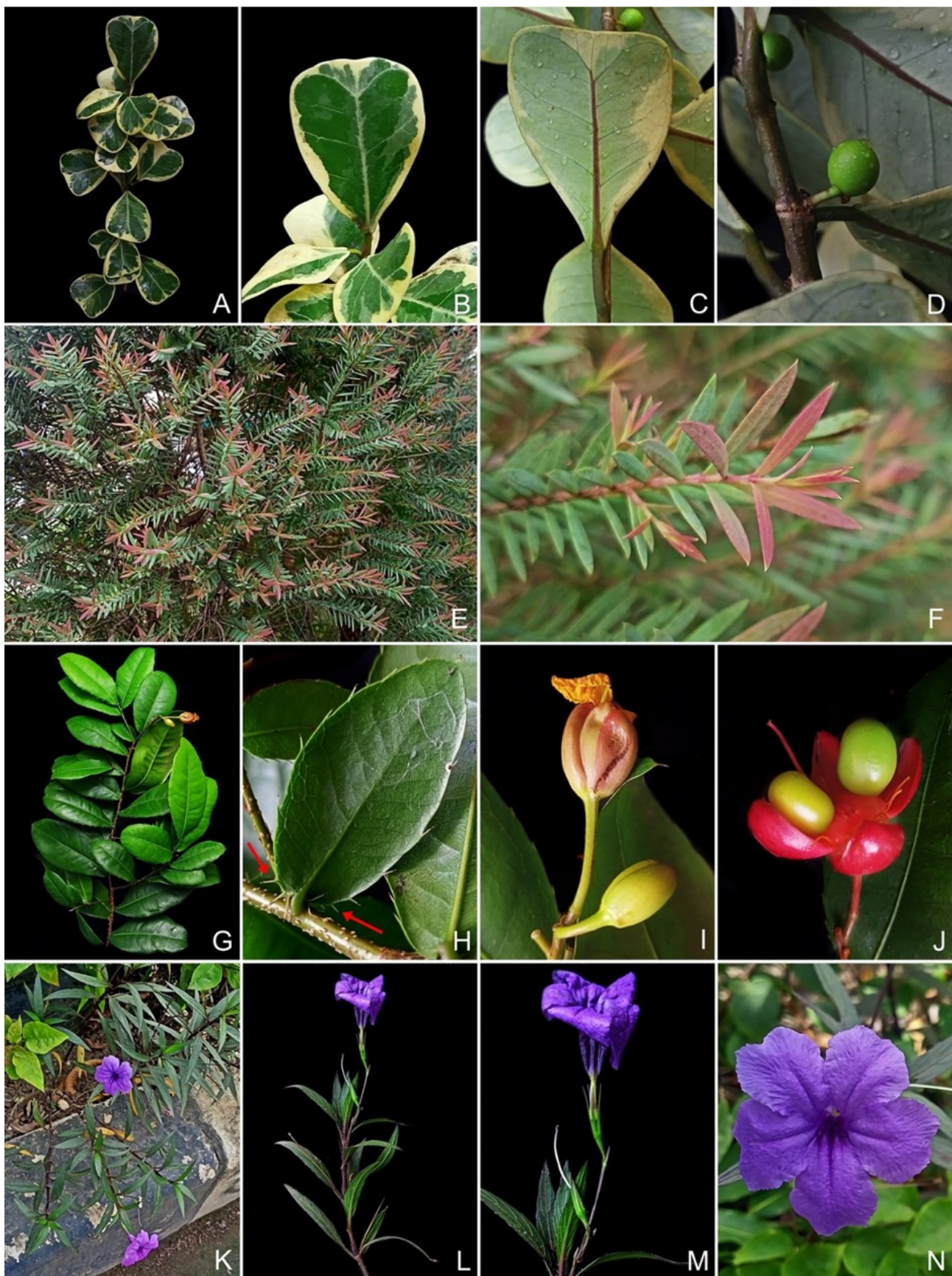
Figure 2. Four alien plants in Sumatra: A–D. Ficus natalensis subsp. lepriurii ; E–F. Melaleuca linariifolia ; G–J. Ochna thomasiiana with acicular marginal teeth (arrows); and K–N. Ruellia simplex .