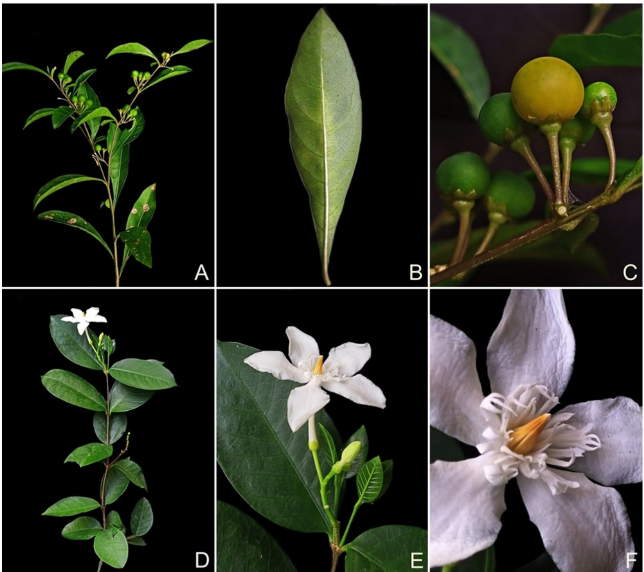
Figure 3. Two alien plants in Sumatra: A–C. Solanum diphyllum ; and D–F. Wrightia antidysenterica .